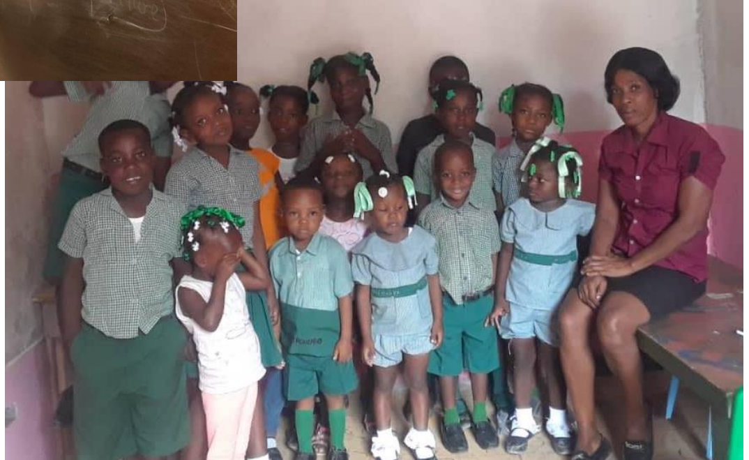
Photos from top to bottom, left to right: 1. Pouring concrete on the roof of the building where we hope to hold school this year...next on the program is pouring a concrete yard for recreation time. 2. "Training for Service" in action...aka graphic design school for adults. 3. Some of our students from last year...these were some of the refugees from the unrest in Carries who lived at the beach property who were able to just walk out the door and go to school on our property. 4. The Kindergarten classroom at the beach...we can't wait to have more space again!