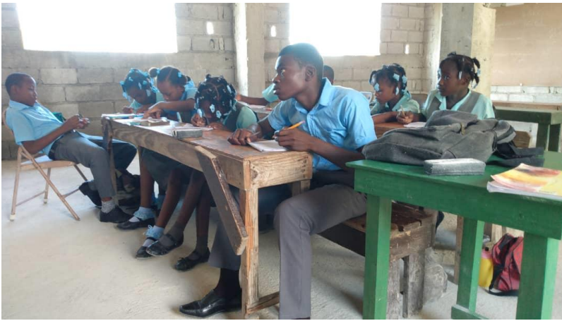
Above: Our 7 th - 9 th grade class, hard at work. Though we had to move the location of the school due to safety concerns our students remain faithful. Some of them have to travel farther now but they are doing all they can to keep learning!