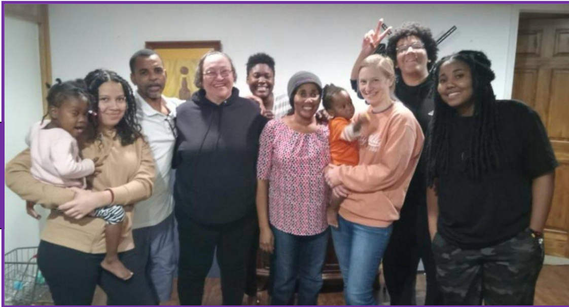
Above: Visiting some of our dearest ones from Haiti who made it here safely after a harrowing journey to escape. Both girls were ones I helped raise/teach while I lived there in Haiti. Right: One of the girls in the above photo when she was much tinier and before she had children of her own!